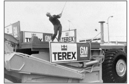
Golfer Jack Nicklaus Hitting Shots from a 'Tee' on a Terex TS-24 Overhung Scraper.

GM's Terex Division creates some of the industry's biggest heavy construction equipment, including the world's first off-road hauler (1Z Trac-Truk), first twin-powered dozer (TC-12) and largest truck, the Terex 33-19 "Titan" – as well as the first TS-8 for the British Army, an all-wheel-drive twin-engine scraper, transportable by aircraft.