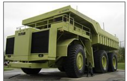
The Titan prototype produced was in service until 1990 and is on display in Sparwood, British Columbia, near the mine it served. It remains the world's largest truck by dimensions.